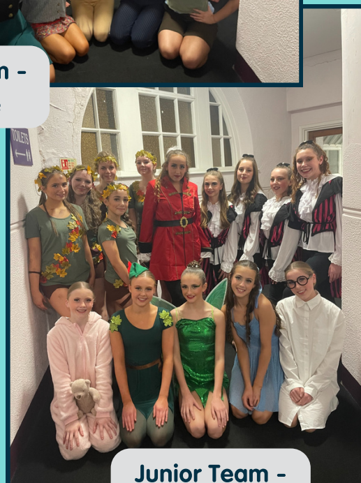
Junior Team - 3rd place