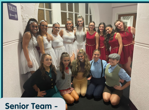
Senior Team - 9th place